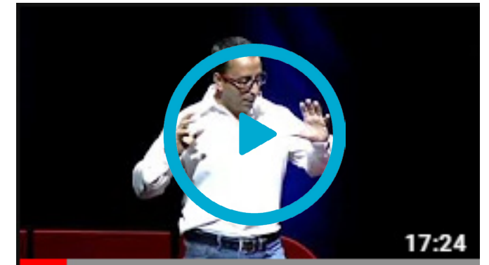
TEDx - the Fourth Industrial Revolution