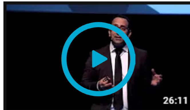
GX Talks - World Government Summit