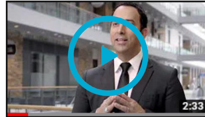
Right Here, Right Now, Today - Introduction

Here is a collection of some of Ian's most popular videos. Just click the Thumbnail below to open the Video in a New Browser Window. Many more available at www.IanKhan.com